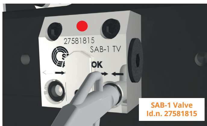
SAB-1 Valve Id.n. 27581815

The Safety valve SAB-1 maintains air pressure in the cylinder pallet transportation / storage or machining without feed.