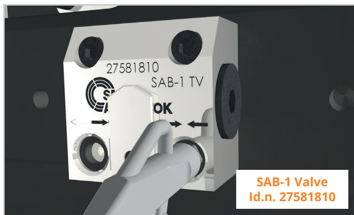
SAB-1 Valve Id.n. 27581810

The Safety valve SAB-1 maintains air pressure in the cylinder pallet transportation / storage or machining without feed.